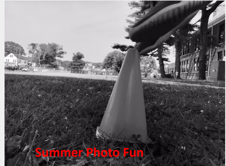
Summer Photo Fun