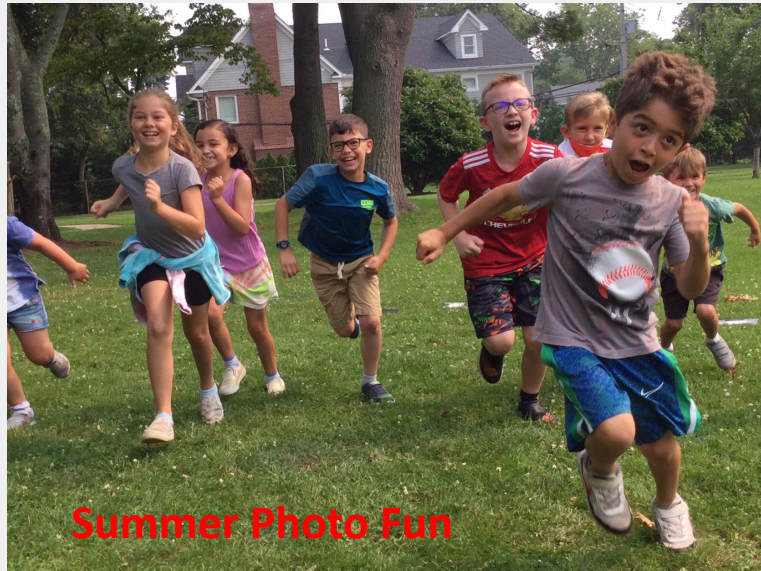
Summer Photo Fun