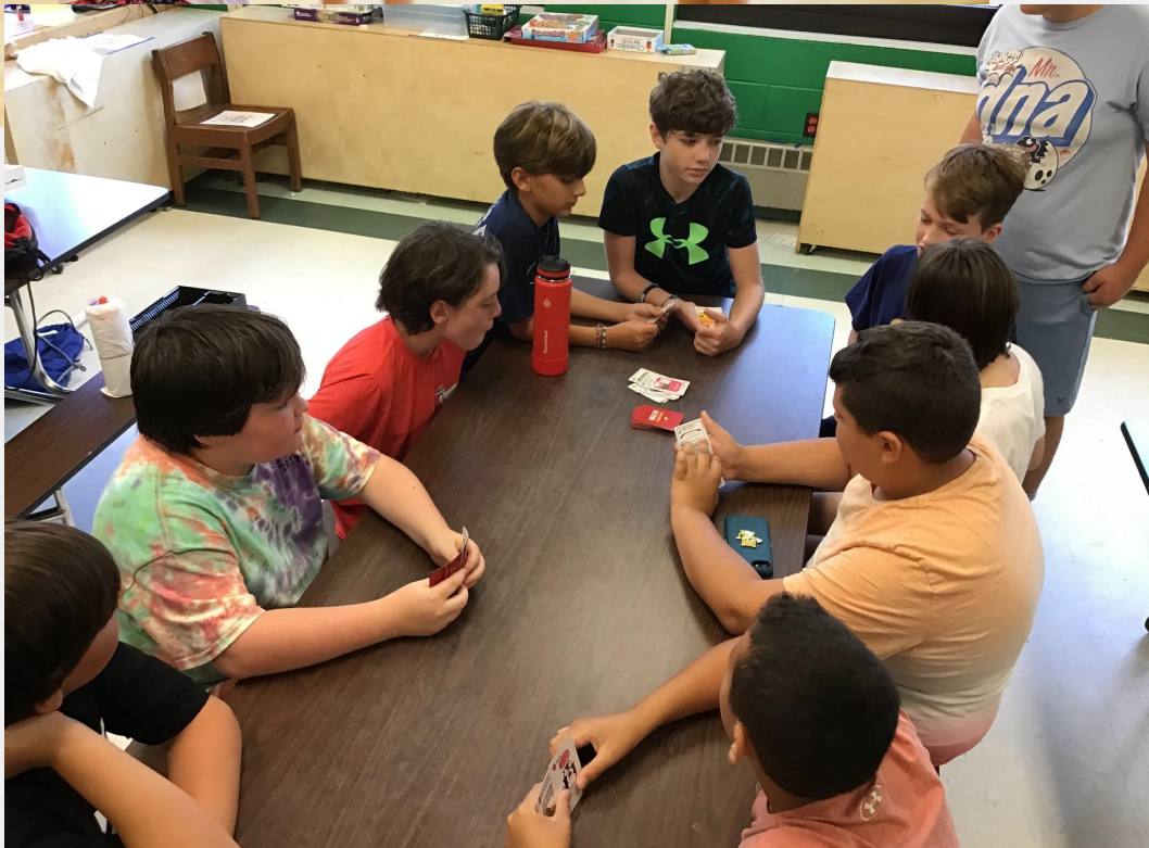
Games of Strategy